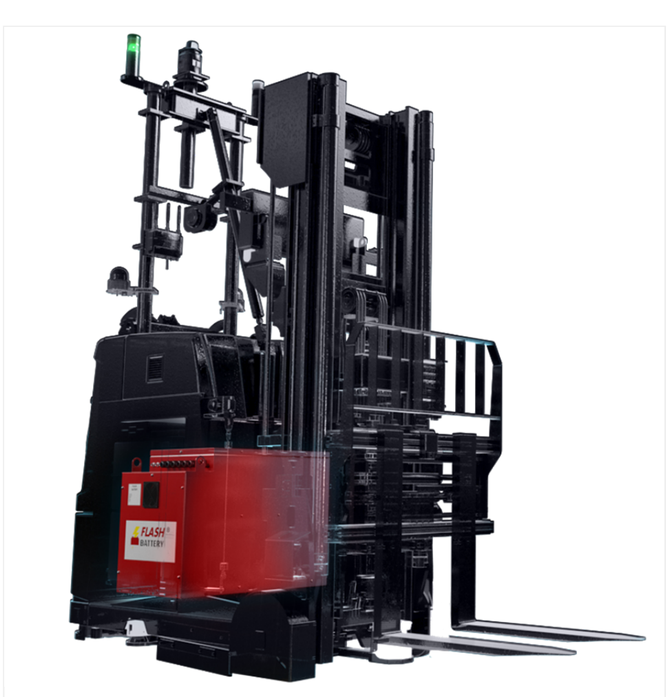
Batteries for industrial applications such as logistics can be used up to a remaining capacity below 40%. Second life is not practical for these batteries.

Second life however is an option that can be combined with recycling but cannot replace it, simply because it is applicable to limited sectors.